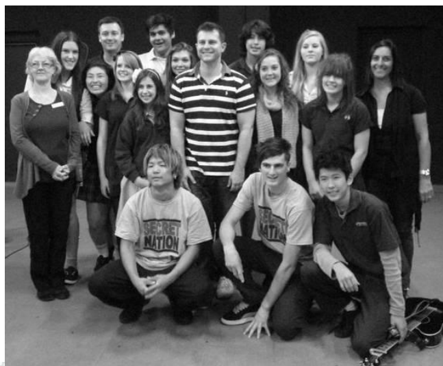
★ Stars of tomorrow performing today ★